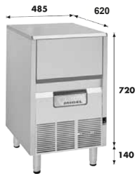
Stainless steel AISI 304