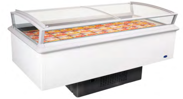
Multinor 2060/80 G